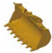
XCMG approved attachments