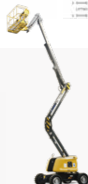
Aerial work platforms